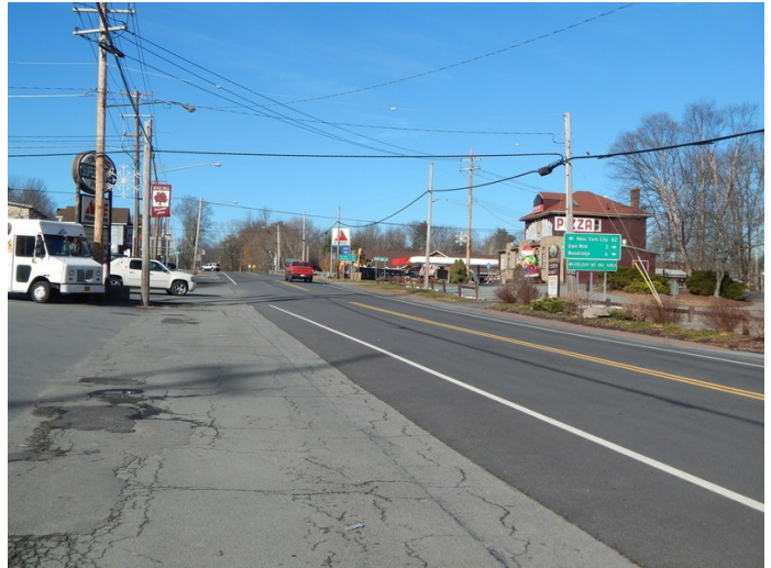
Lake Louise Marie Road finished with PPST Type B