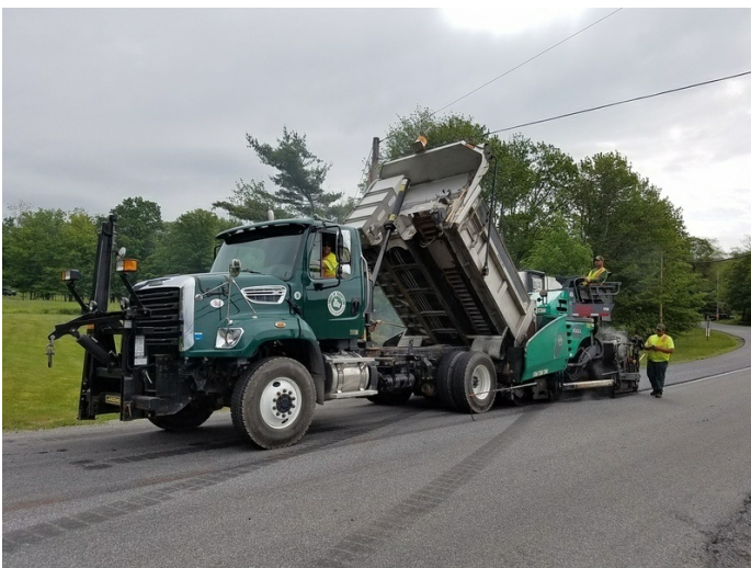
The Gorman Group paving with PPST Type B, utilizing the Town of Thompson to haul material