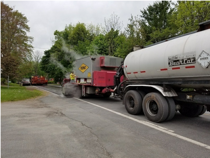
The Gorman Group laying interlayer fiber reinforced system