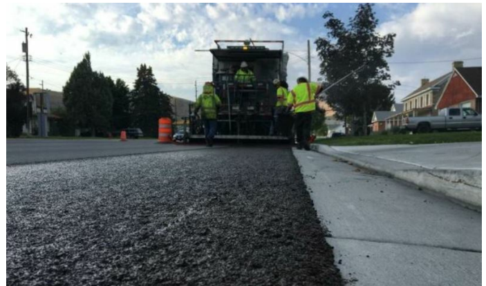
Micro Surfacing Application by Intermountain Slurry Seal with Bergkamp M1E Continuous Paver