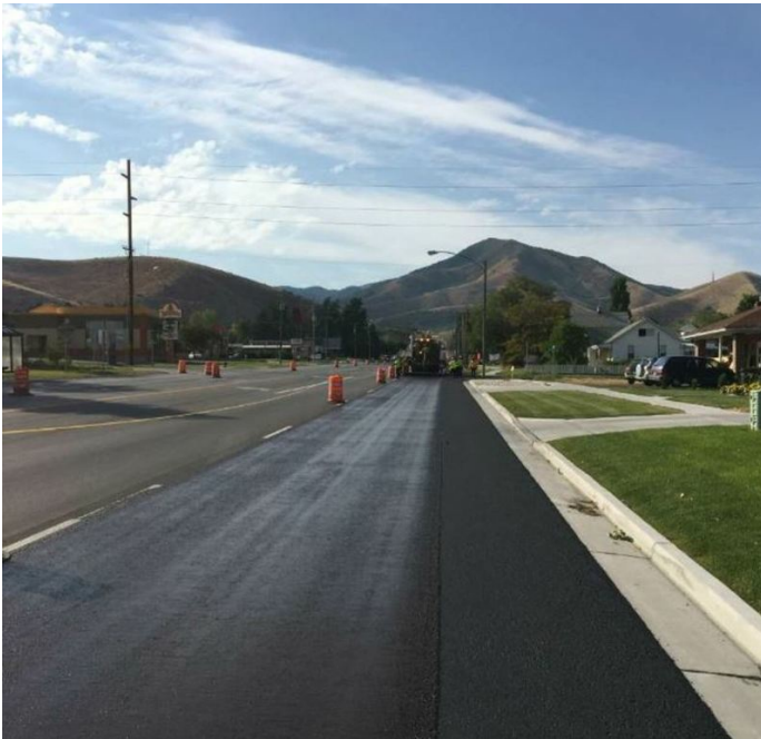
Micro Surfacing Application Intermountain Slurry Seal