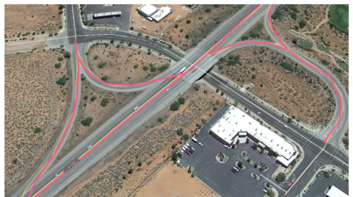
Ramps before construction