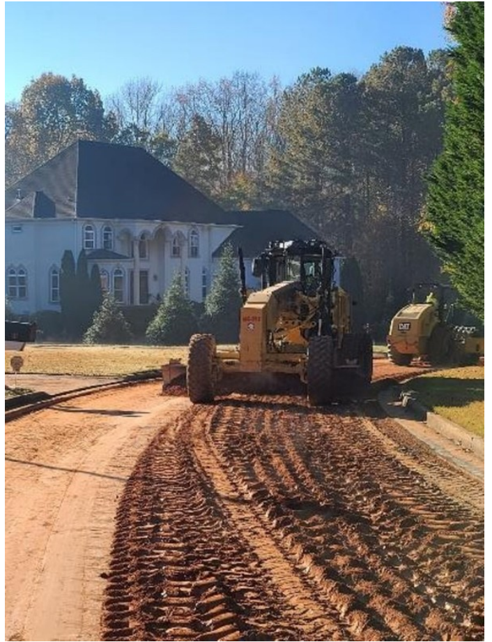
Compaction and final blading of FDR mix.