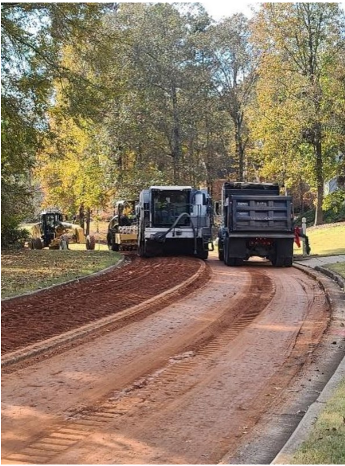
FDR with Cement