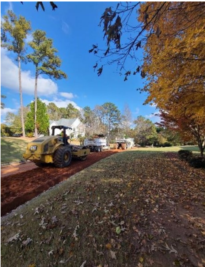
Performing FDR with Cement