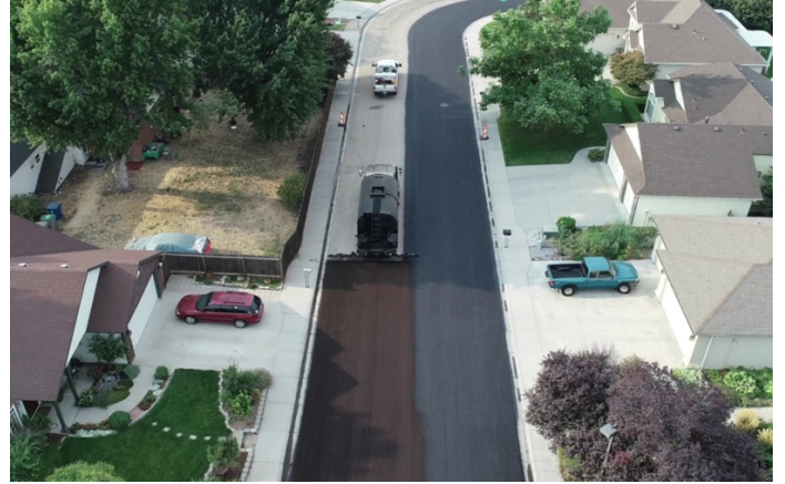
Fog Seal Process