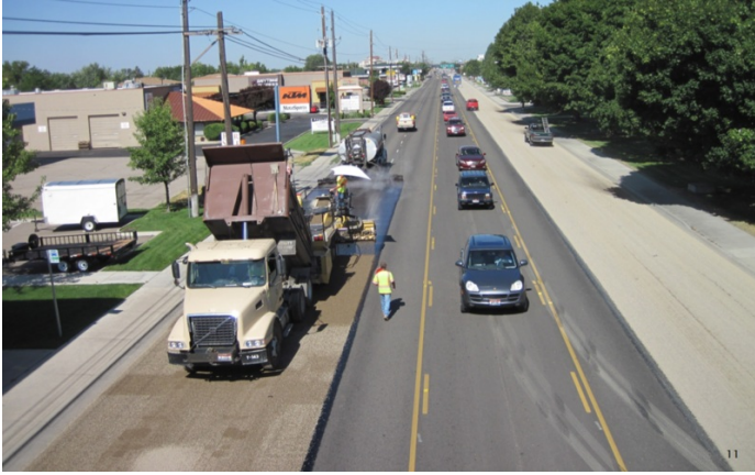
Chip Seal Process