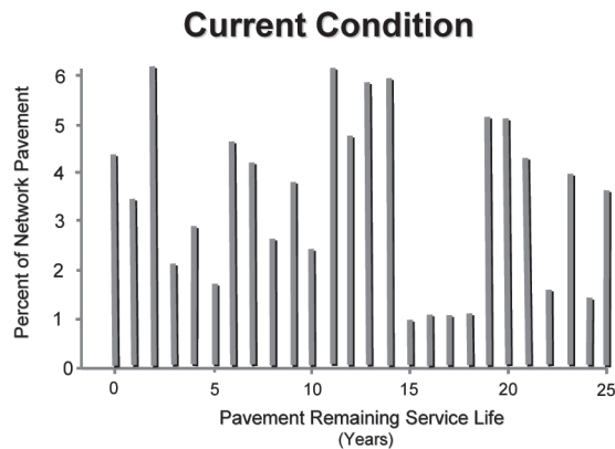
Figure 1. Current condition.

Assume that every lane-mile segment of road in the network was rated by the number of years remaining until the end of life (terminal condition). Remember that terminal condition does not mean a failed road; rather, it is the level of deterioration that management has set as a minimum operating condition for that road or network. Consider the rated result of the current network condition, shown in Figure 1.