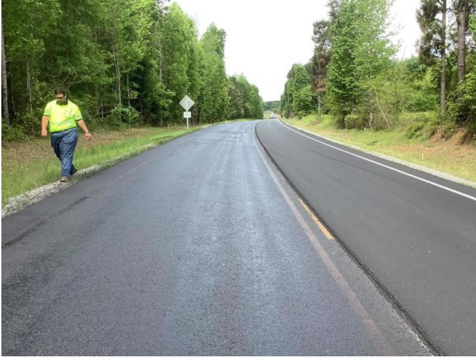
Perfect Uniform Coverage of Broken Trackless Tack