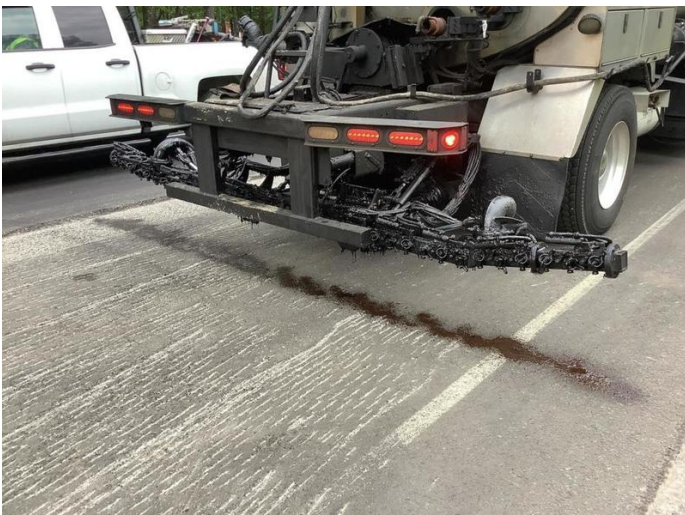
Prior to shooting trackless tack and checking each nozzle.