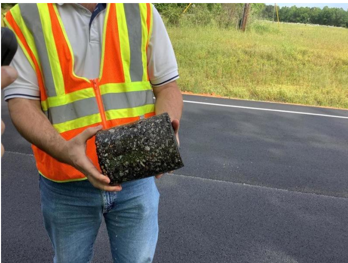
Core Cut showing tack bonded Pavement Layers