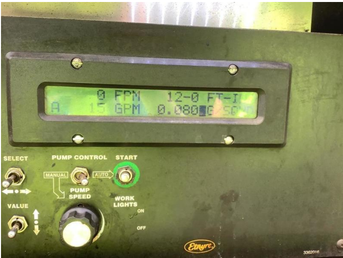
Shot Rate on Distributor Computer 0.08gal/sy