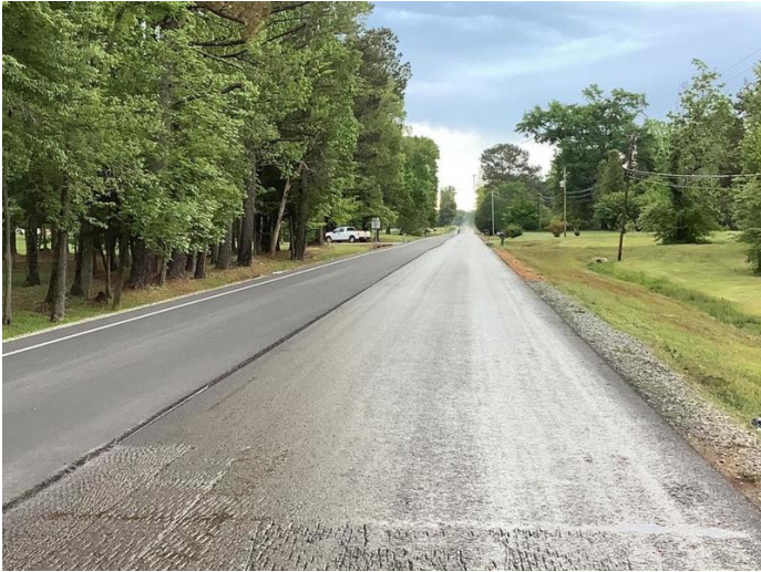
Uniform Shot Rate (Not Broken)