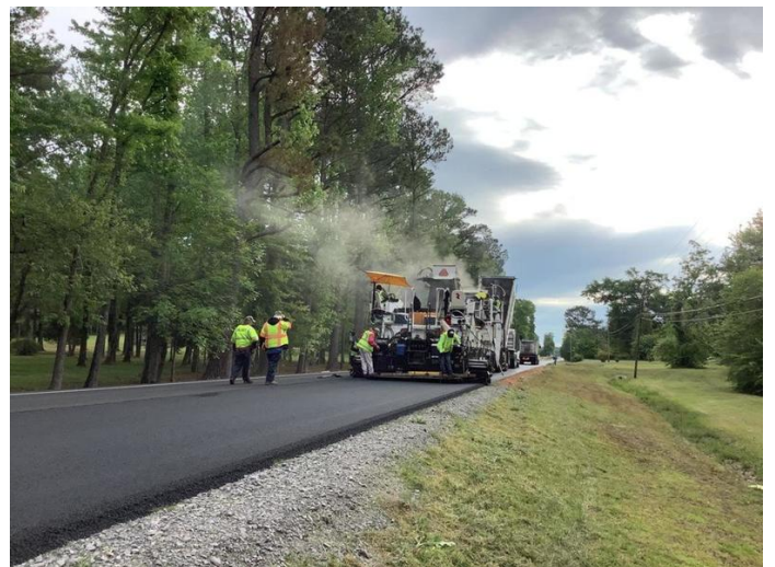
Paving Hot Mix