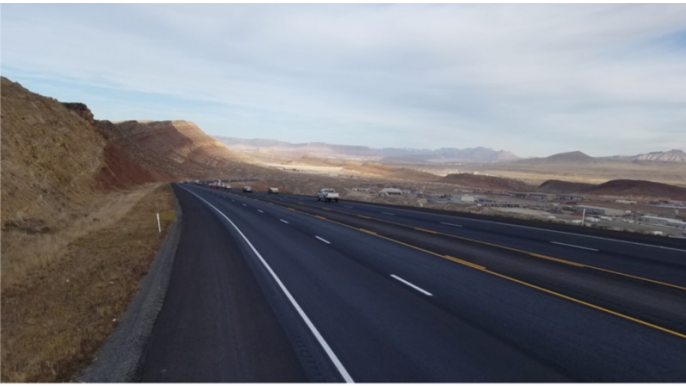
Completed Micro Surfacing