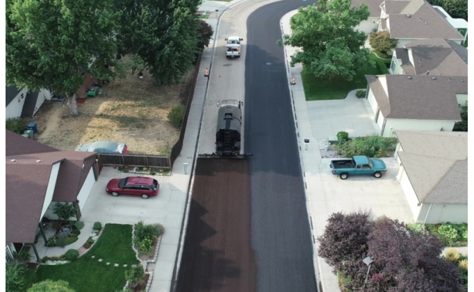
Fog Seal Process