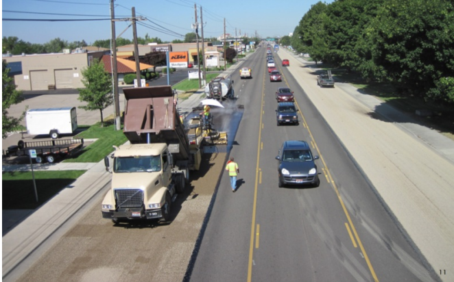
Chip Seal Process